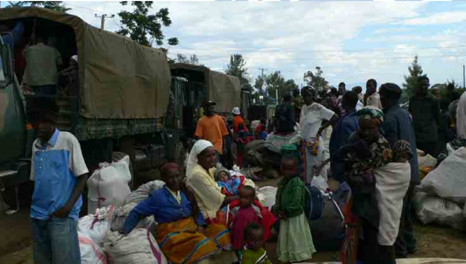
MoSSP assisted relocation from Nakuru to Nyahururu, Nyandurua district. (2,000_ HH)