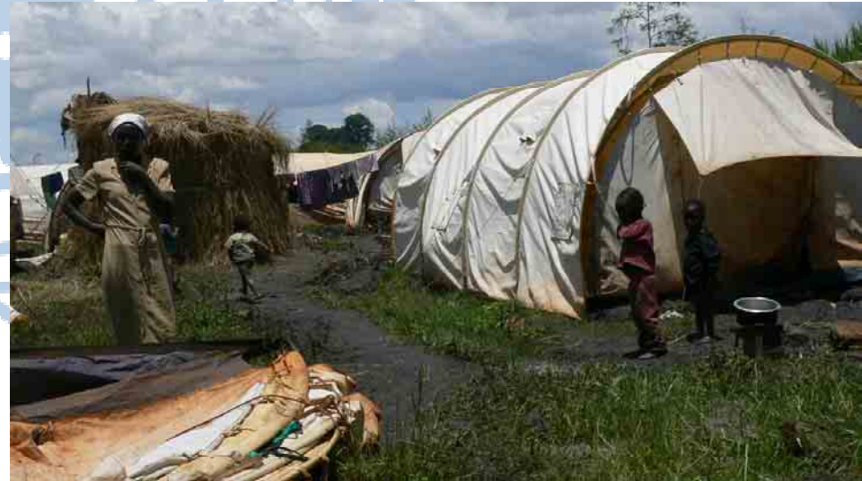
Unassisted Zea Endeless IDP Landless Group, Kwanza district. (42 HH)