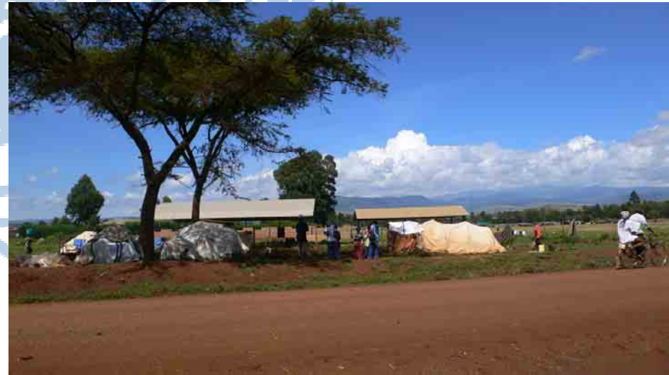
Kwanza DC's Office Transit Site 80 pp