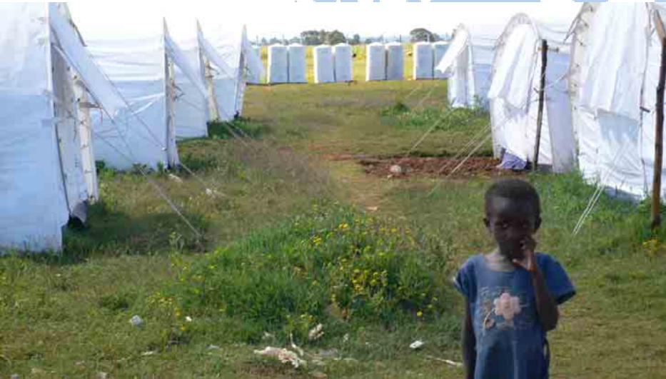
Yamumbi Transit Site, Uasin Gishu 3,000 pp